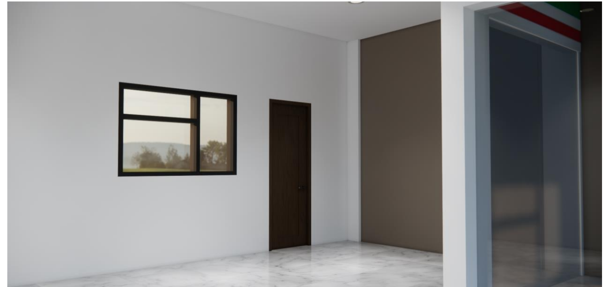
BAYSIDE TIENDA HOMES