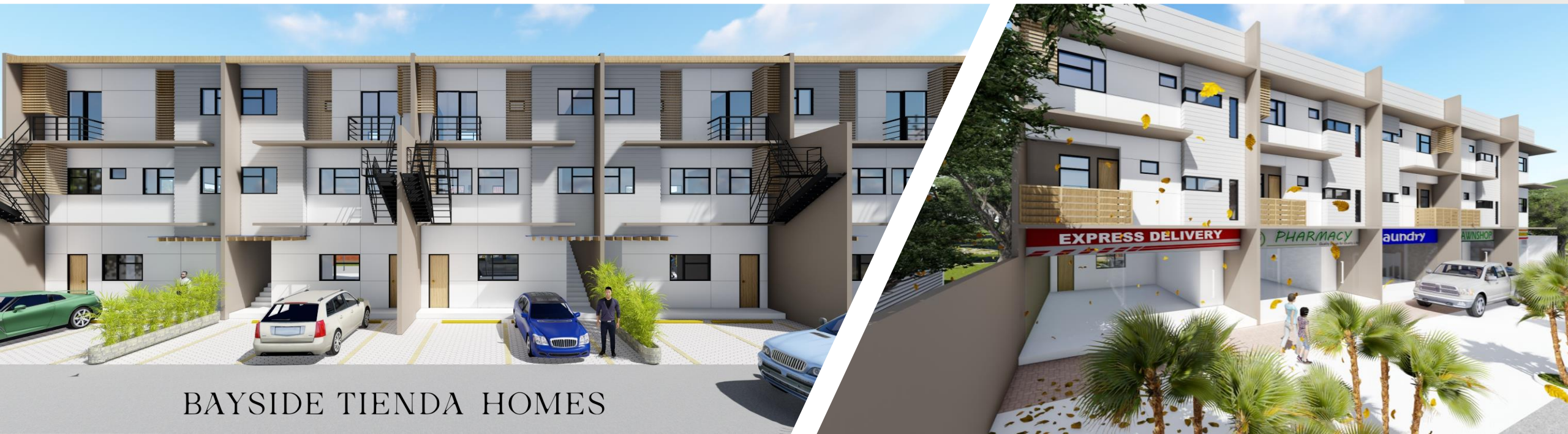
BAYSIDE TIENDA HOMES